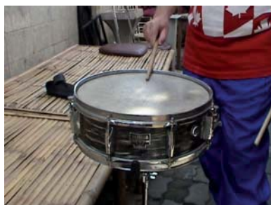
LATIN RIM SHOT