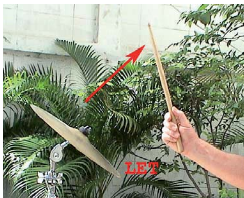
COME UP ON THE LET COUNT AFTER THE 1 AND THE 3.