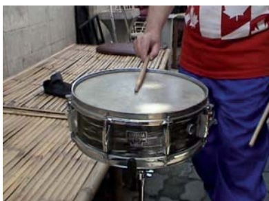
LOUD RIM SHOT