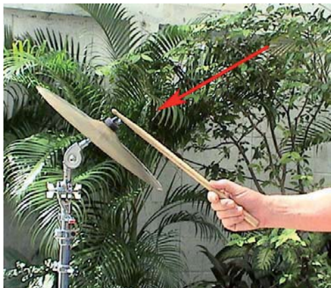
MOVE DOWN ON 1, 2, 3, and 4