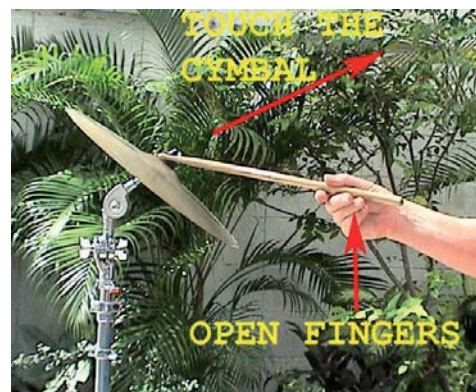
DRAG YOUR STICK UP ON THE LET COUNT AFTER THE 2 AND 4, AND PLAY A SOFT NOTE