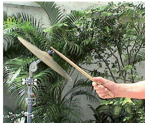
STAY DOWN AND COUNT TRIP