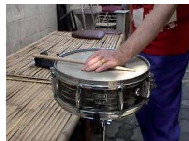
LEFT HAND RIM SHOT